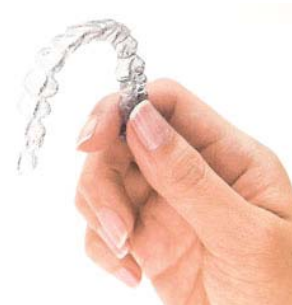
Invisalign™ Removable Clear Aligners